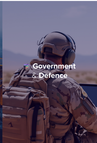
Government & Defence