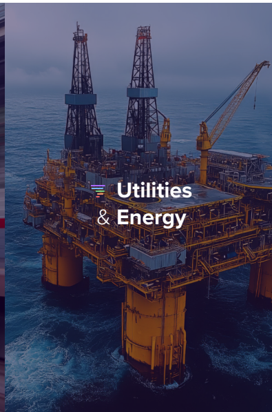
Utilities & Energy