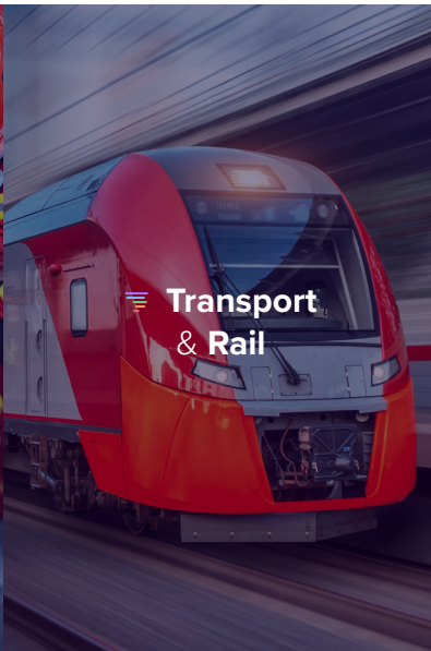
Transport & Rail